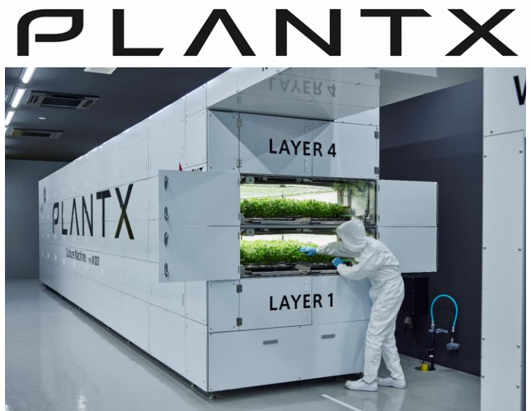
A closed-type plant production machine