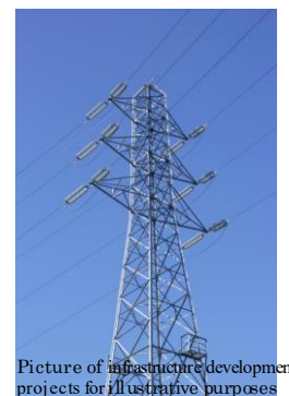
Picture of infrastructure development projects for illustrative purposes

The Dai-ichi Life Insurance Group is expanding its life insurance operations in India and the Mekong Region, and aims to improve global QOL. We will contribute to further improvement of QOL by supporting economic development and solutions to social issues in these countries through this initiative.